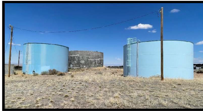
Figure 10-1 Oak City Water Storage Tanks

The Oak City Water system includes two above ground steel water storage tanks and one concrete water tank that provide the total storage capacity for the water system of 1.05 million gallons see Figure 10-1.